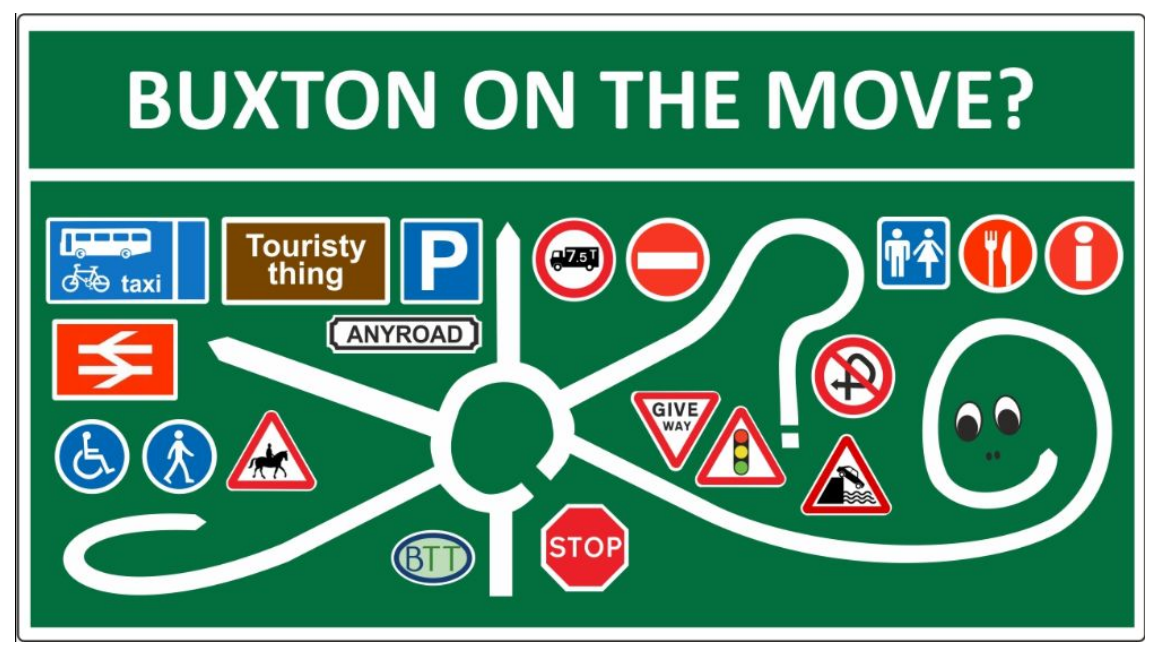
Moving Together & Travelling Light