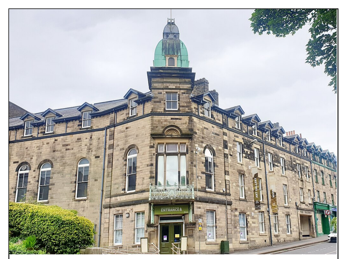
Save Buxton Museum & Art Gallery

Buxton Museum & Art Gallery (BMAG), which is run by Derbyshire County Council (DCC), was suddenly closed on 1<sup>st</sup> June 2023 with DCC citing the discovery of dry rot in the building's structural timbers as cause for 'temporary closure'. https://www.derbyshire.gov.uk/council/news-events/news-updates/news/temporary-closure-for-