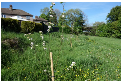
Sherwood Rd 20 th Nov 2021

The approximately 100 trees of the 'dispersed orchard' are planted at a dozen sites around the town and are of different ages. Some seem to do well and others seem to be more reluctant to make a good showing, despite our efforts. But this year most trees made a good showing of blossom and we hope that this will turn into fruit. The trees planted in the winter seem to be thriving. (see pics with planting dates) There are always maintenance tasks to carry out through the year and we are always on the lookout for people to join our team of tree guardians. We value the help of people with good knowledge of all aspects of fruit tree arboriculture, so that we can hone our skills to achieve more competent work. If you would like to share your expertise, please email orchard@transitionbuxton.co.uk